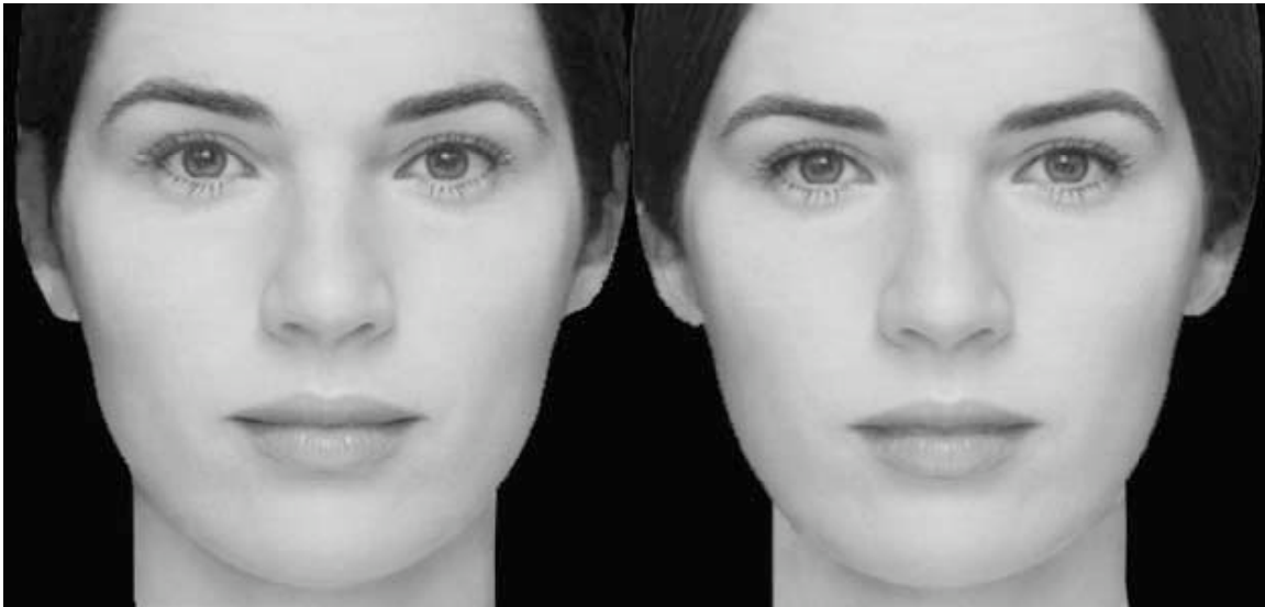
Figure 1. Sample pair of stimulus faces, obtained by morphing the members of a female monozygotic twin pair with the female model.

desire to acquire the person as a sibling-in-law. Although a family-resemblant person might seem an unsuitable spouse for one's sibling because of inbreeding costs, people tend to choose family-resemblant partners for long-term alliances such as marriage (e.g., Hinsz 1989; Berezkei et al. 2004), suggesting that fitness benefits overcome the costs. Also, same-sex faces have been shown to elicit judgments of prosocial regard, rather than of sexual or romantic appeal to the judge (DeBruine 2004). Question order was counterbalanced between subjects. At the end, participants completed a brief questionnaire and were asked to estimate of the quality of their inter-twin relationship on a 1-10 scale. At debriefing, no participants reported recognizing their own or their co-twin's traits in the morphs.